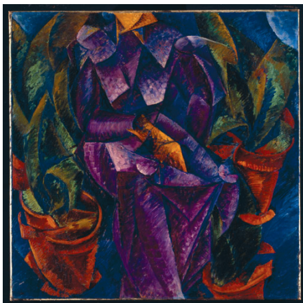
Fig.1 The painting after the restoration.

“Costruzione Spiralicca” an Umberto Boccioni oil painting on canvas, 95 x 95 cm, dates between 1913-1914 (Fig.1). The work showing a seated female figure is a negation of the traditional portrait genre. The composition focuses on the absence of face of the subject, whose form, disarranged in spiral patterns, occupies the centre of the painting.